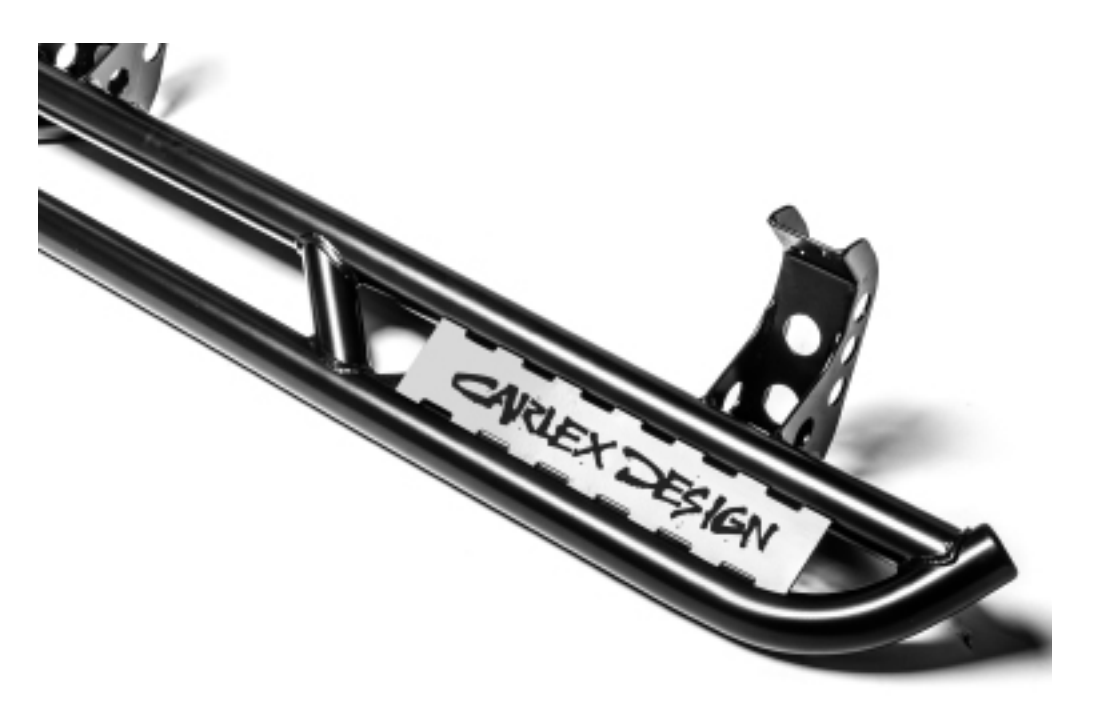
Carlex Design Terrain side steps black powder-painted