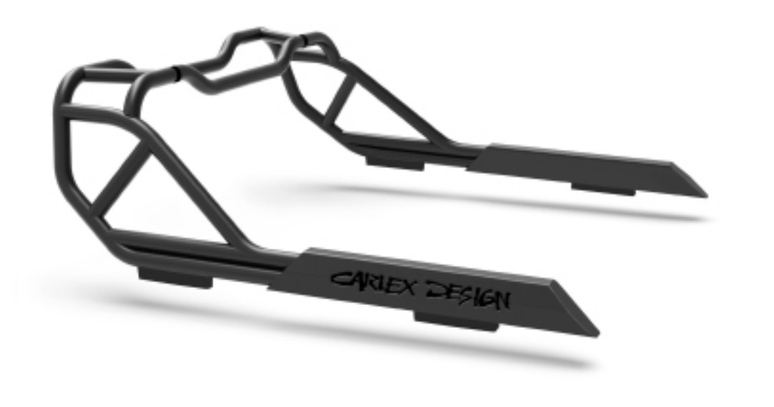
Carlex Design StyleBar Extreme black powder-painted steel tonneau bar