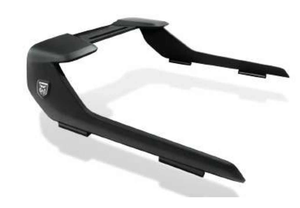
Carlex Design StyleBar tonneau bar painted black