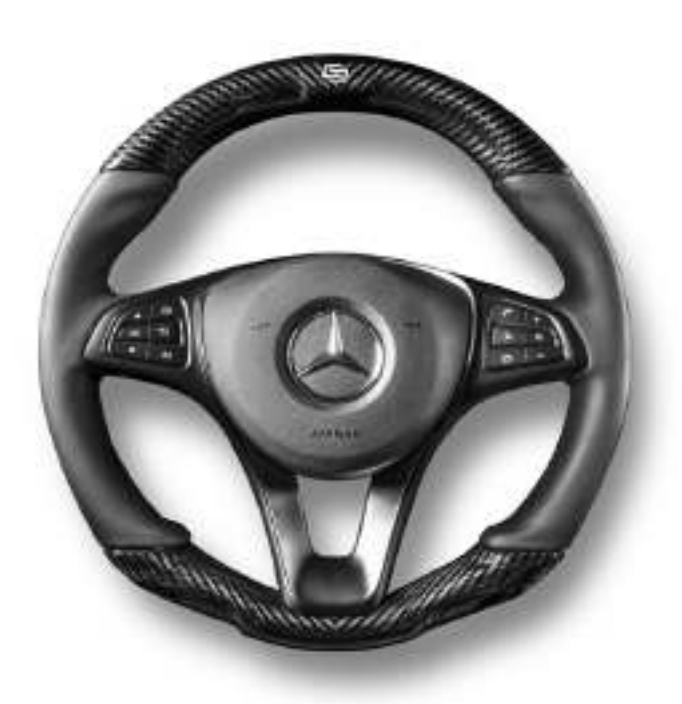
Carbon steering wheel modification reshaping, trimming with black leather, carbon inserts