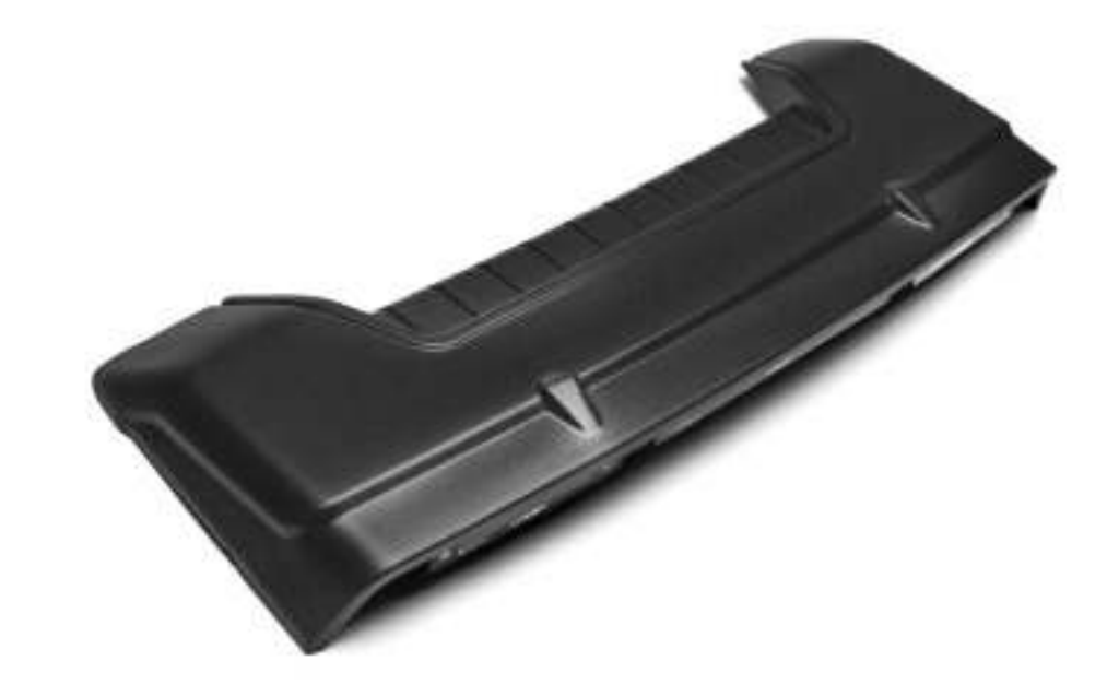
Carlex Design roof light cover

2 x Lazer Linear 6 Standard, 1 x Lazer Linear 12 Standard