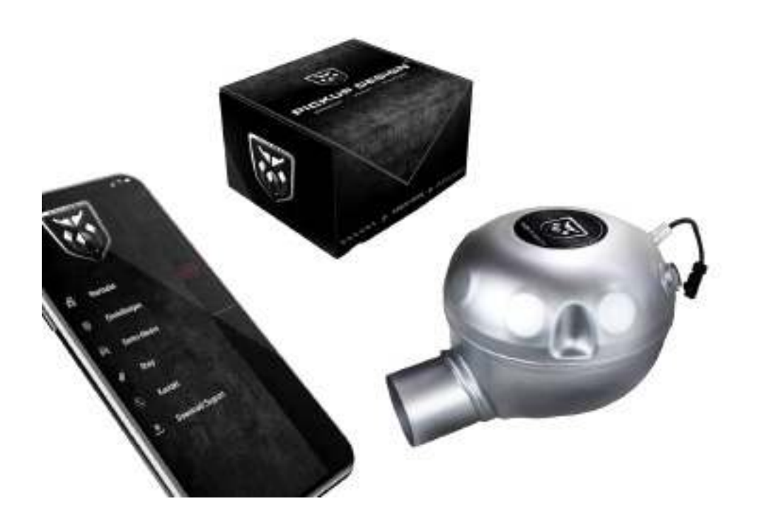
Pickup Design V8 Exhaust Sound System