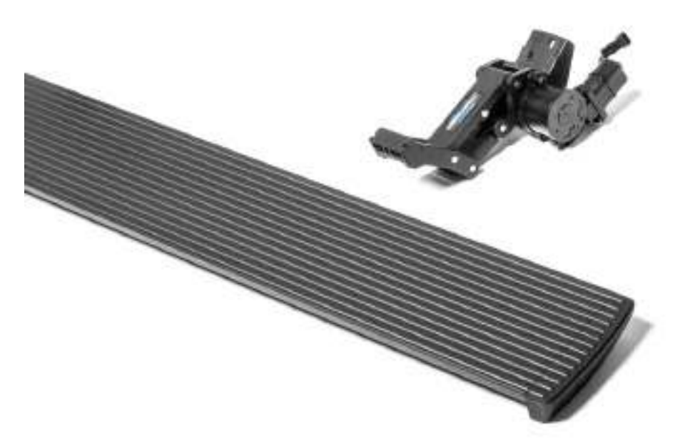
SmartBoard electric side steps