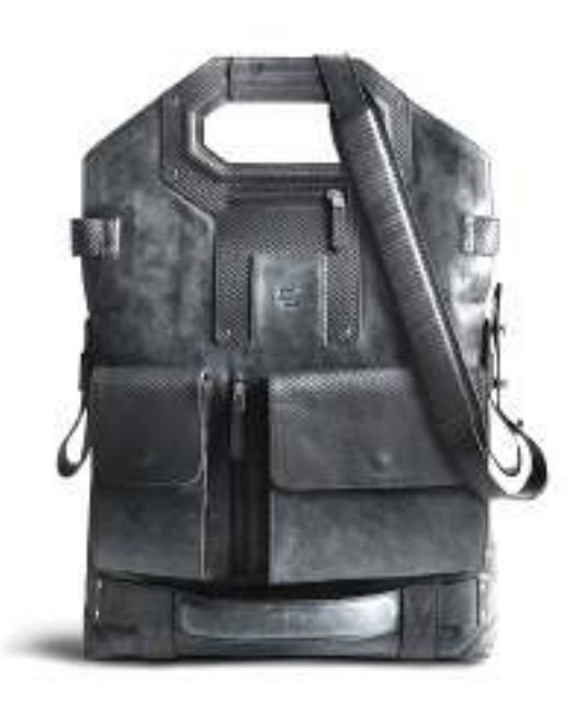
Carlex Design backpack

2 x Lazer Linear 6 Standard, 1 x Lazer Linear 12 Standard