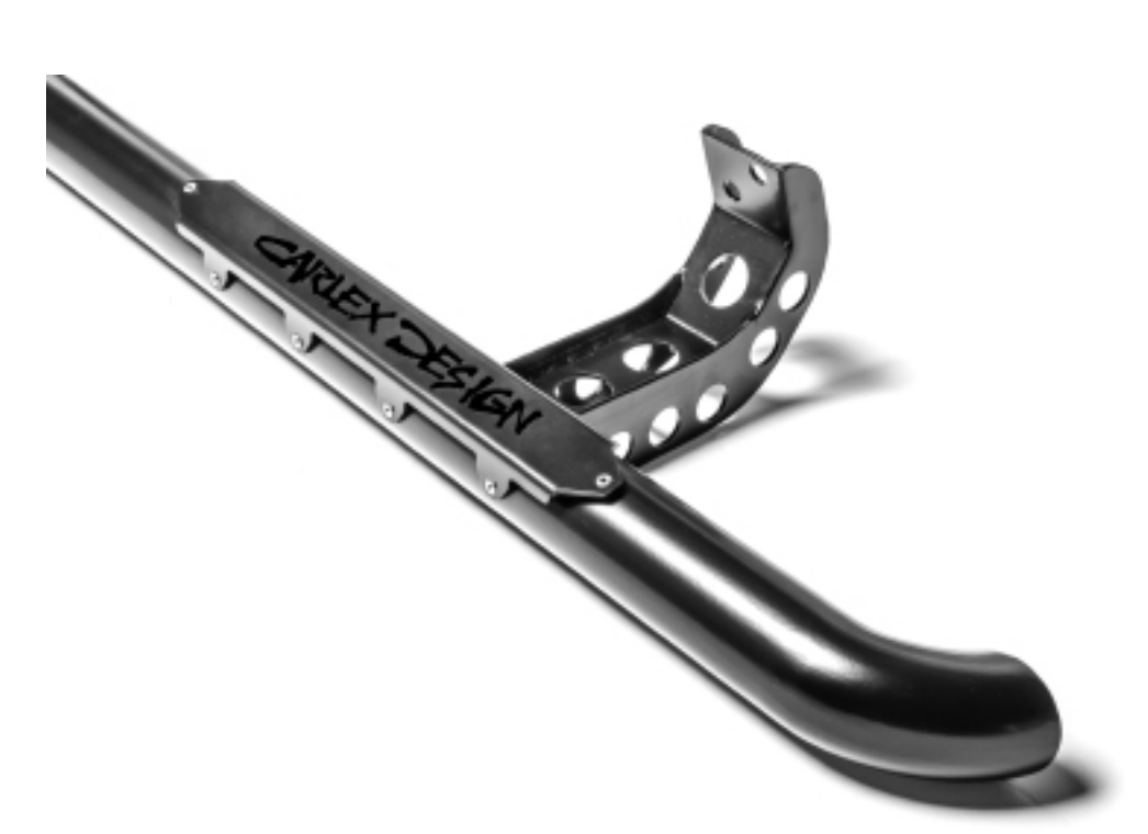
Carlex Design City2 side steps black powder-painted