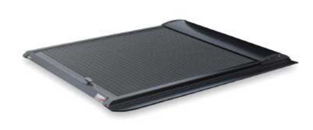
Roller lid shutter