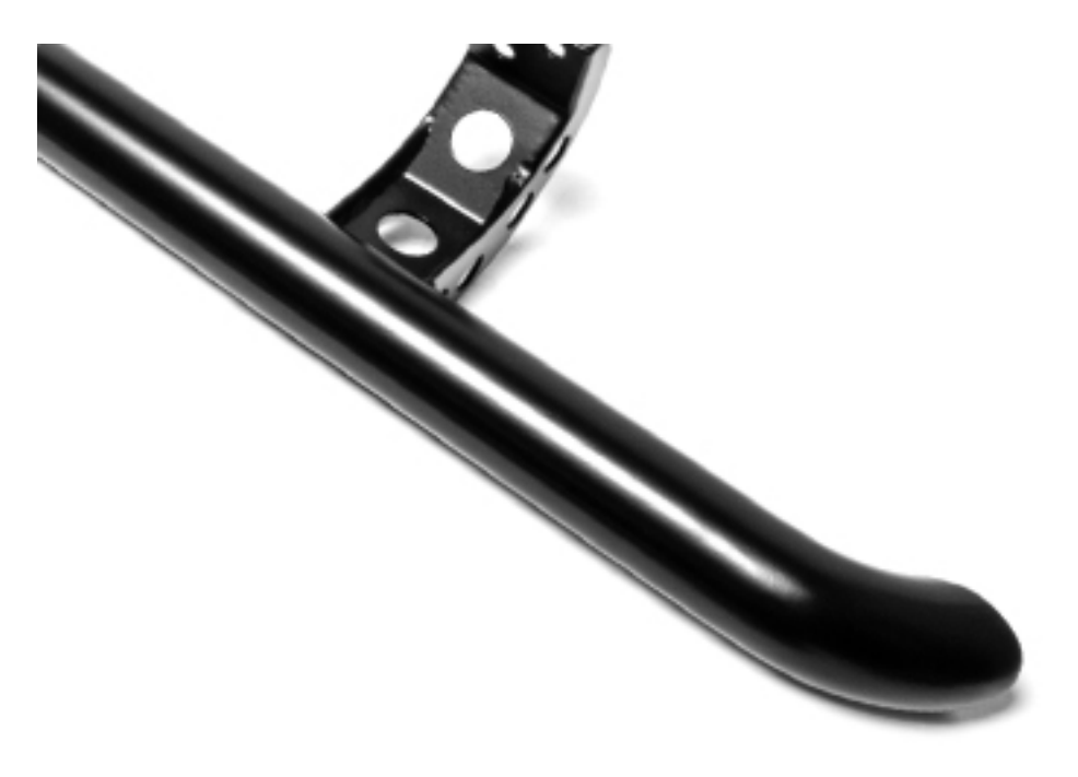
Carlex Design City1 side sills black powder-painted