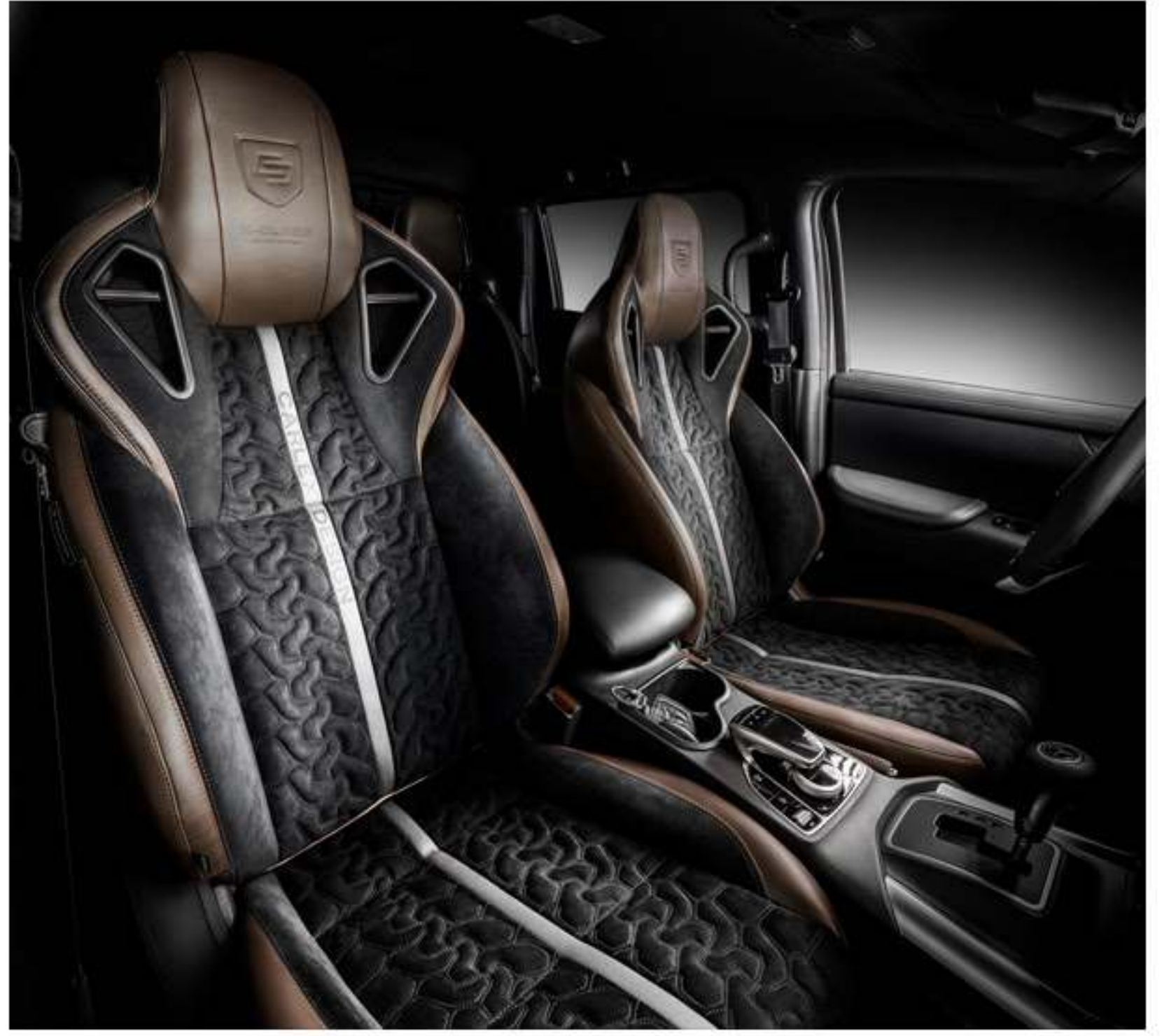
brown upholstery for vehicles with a brown interior

Do you prefer a more sporty character? Modified leather and Alcantara® sport seats are available as an option.