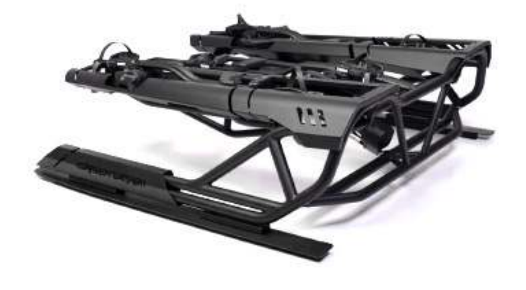
Carlex Design StyleRack option to carry 1-3 bikes, equipped with electric lifting system